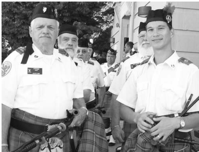
MEMBERS OF THE Aleppo Highlanders performed at Wentworth Institute for the August 23rd Commencement exercise.