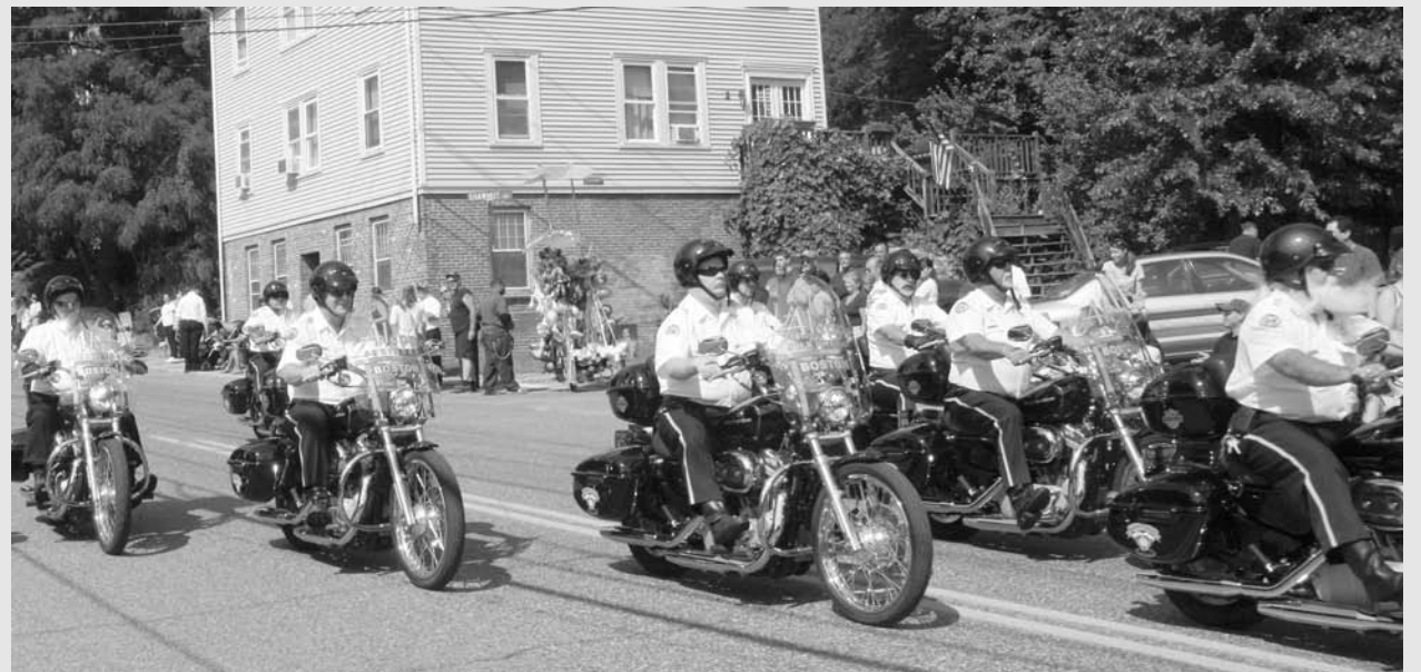
THE CYCLES UNIT participated in the Labor Day Parade in Marlboro on September 7, 2009.