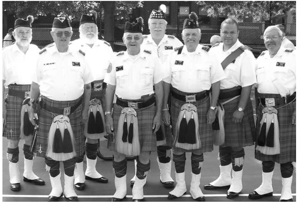
MEMBERS OF THE Aleppo Highlanders performed at Wentworth Institute for the August 23rd Commencement exercise.