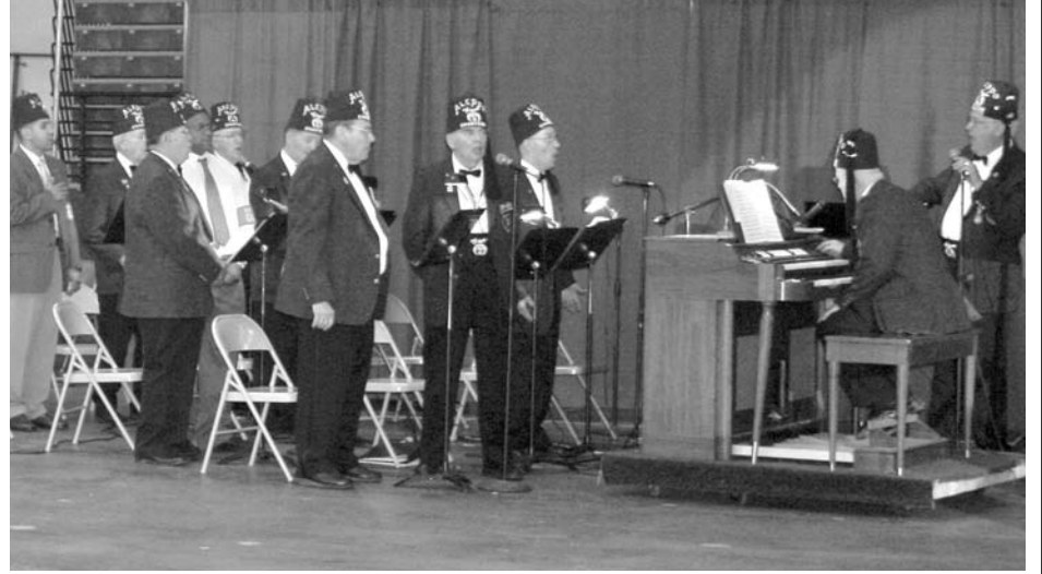
THE CHANTERS PERFORMING AT THE JUNE 2, 2007 ALEPPO CEREMONIAL