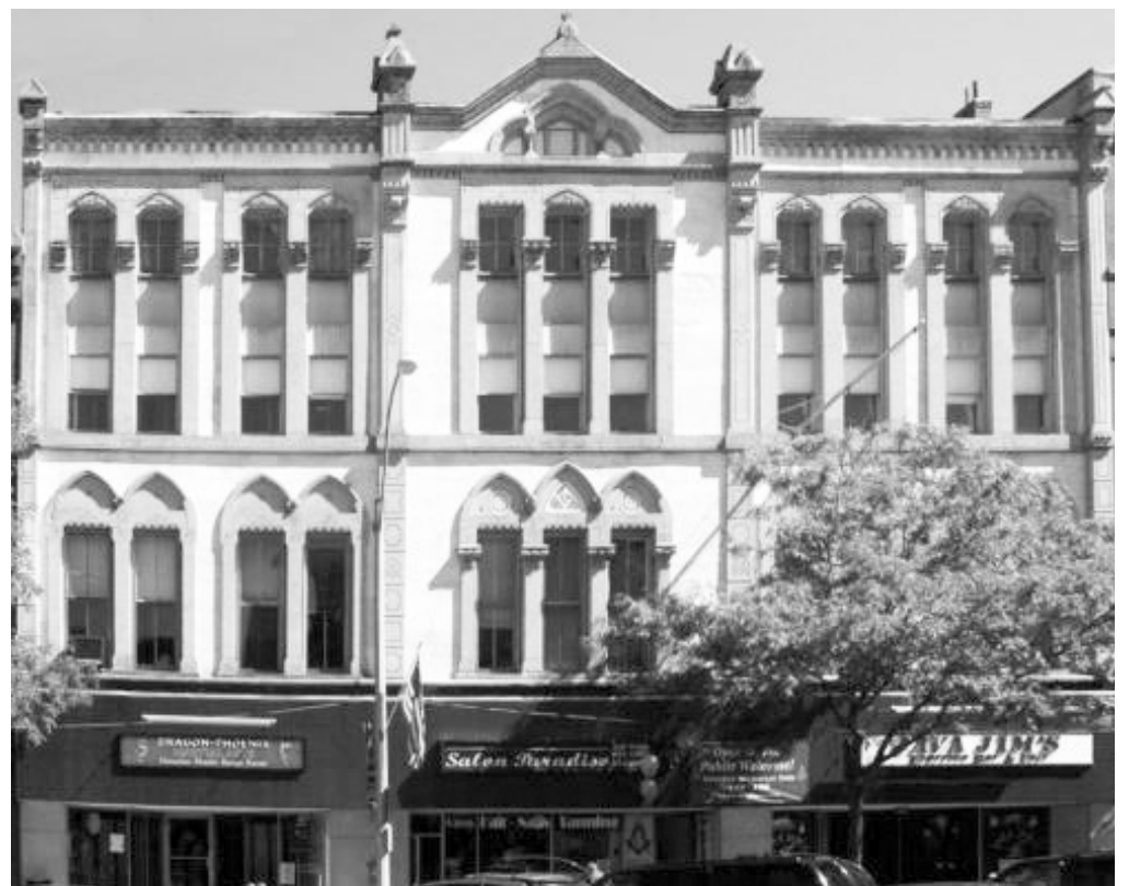
MERIDIAN LODGE A.F. & A.M. 24 MAIN ST. NATICK, MASSACHUSETTS 01760