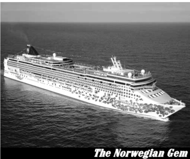
The Norwegian Gem

All rates are per person, twin occupancy, plus $282.95 in port and government taxes, and a fuel surcharge (subject to change).