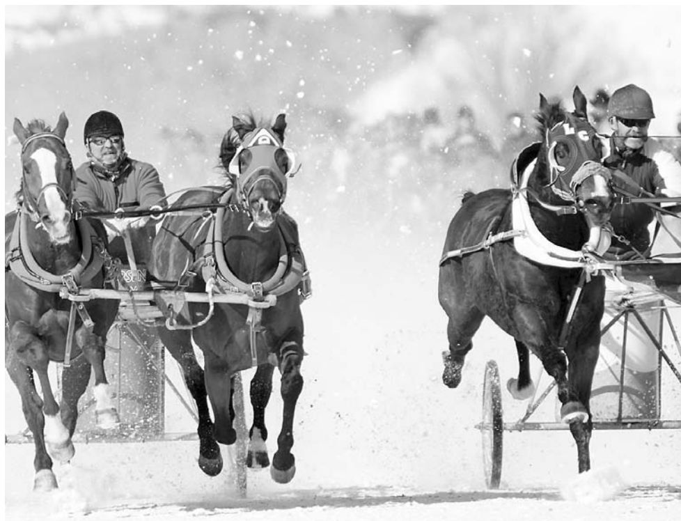
FORTY TEAMS PARTICIPATED in the Jackson Hole Shrine Club Cutter Horse Race held in February to benefit the Shriners Hospital in Salt Lake City.

Thanks to the efforts of Shriners who volunteer to work on events like these, more than 865,000 children each year receive one-of-a-kind medical care — at no charge — at the 22 Shriners Hospitals for Children.