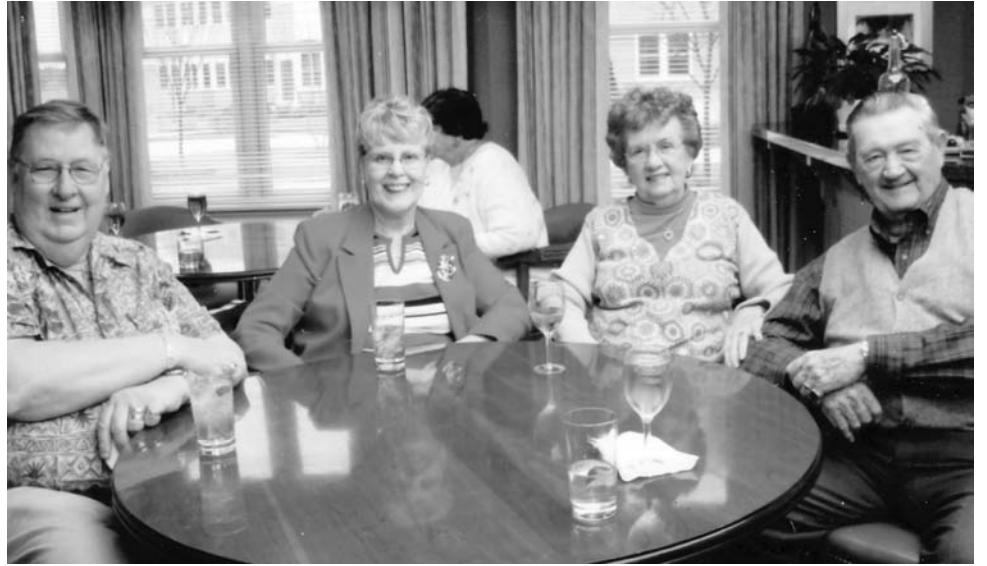
THE CORNWELLS and Bennetts relax and have a drink in the bar lounge at the Overlook.