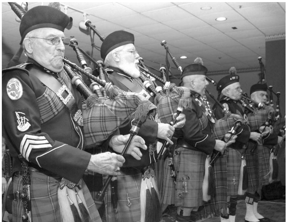
THE ALEPPO HIGHLANDERS played for the attendees of the Tartan Ball on April 28, 2007. They came marching into the Fez Room filling the entire room with their melodious and thundrous sounds.