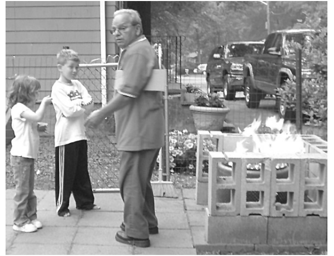
THE CYCLES had the fire pit going so everyone could warm up during the cold rainy day at the picnic, and how about some marshmallows.