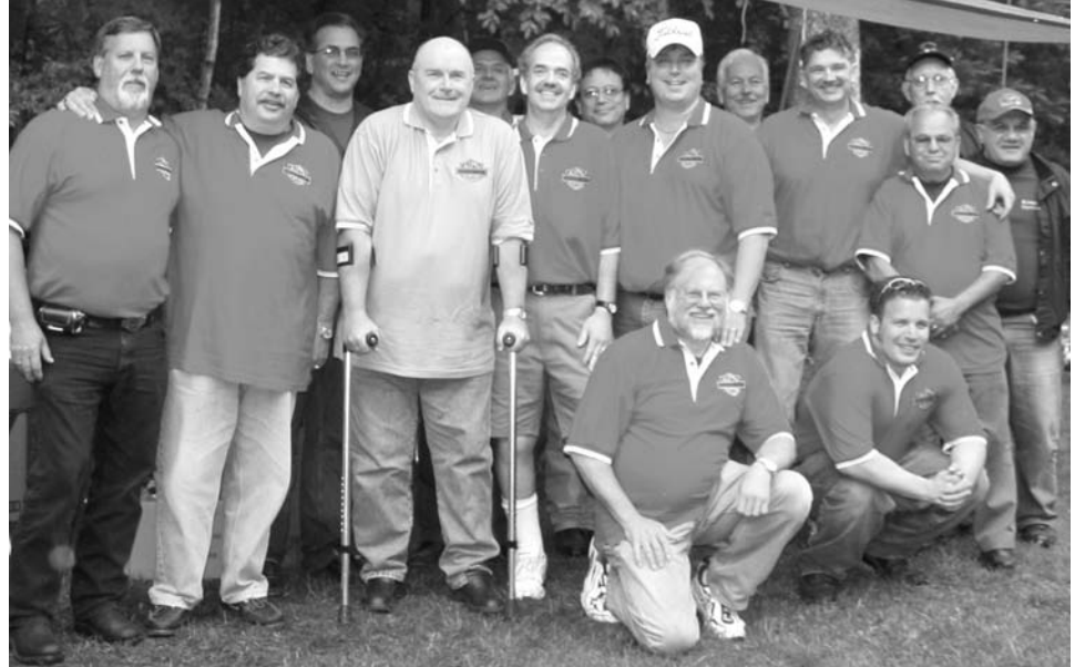
THE CYCLES UNIT took time out to pose for a group photo in between cooking, playing and giving the kids rides on the bikes.