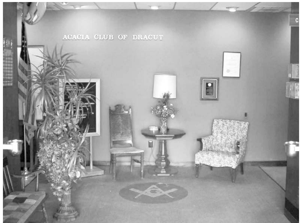
MAIN ENTRANCE TO THE ACACIA CLUB OF DRACUT 251 SLADEN ST. • DRACUT MA 01826