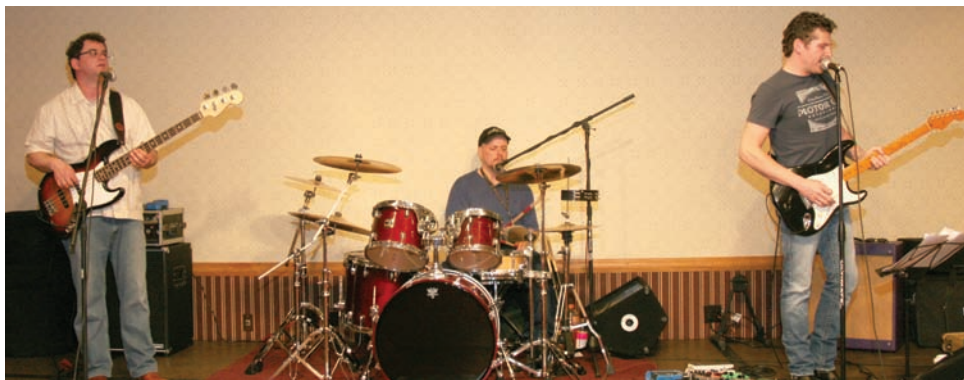
UNION PROJECT rocked the Aleppo Shrine Fez Room at the Rockin' Noble Party on April 17, 2009.