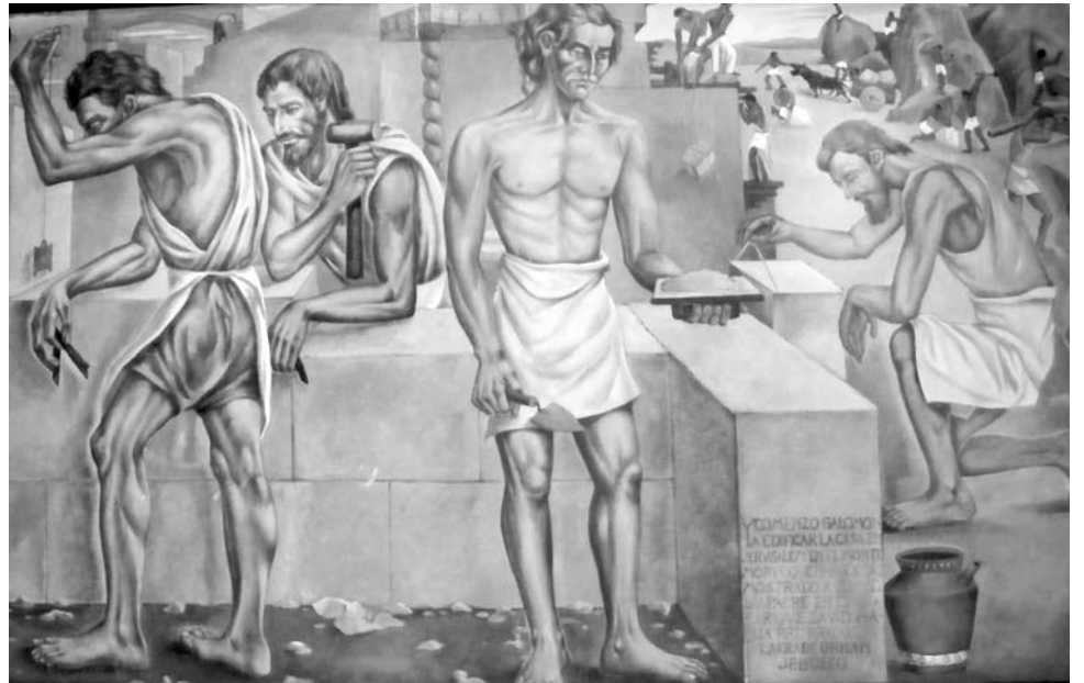
A FRESCO IN THE Temple room of Cuna de America Lodge No 2 depicts masons using their working tools to build King Solomon's temple. visit http://cunadeamerica.blogspot.com for details

The Shrine has been active in the Dominican Republic since 1979. The Shriners Hospitals for Children—Boston and Springfield regularly hold outreach clinics there. The Dominican Shrine Club is under the jurisdiction of Aleppo Shriners in Wilmington, Massachusetts, USA.