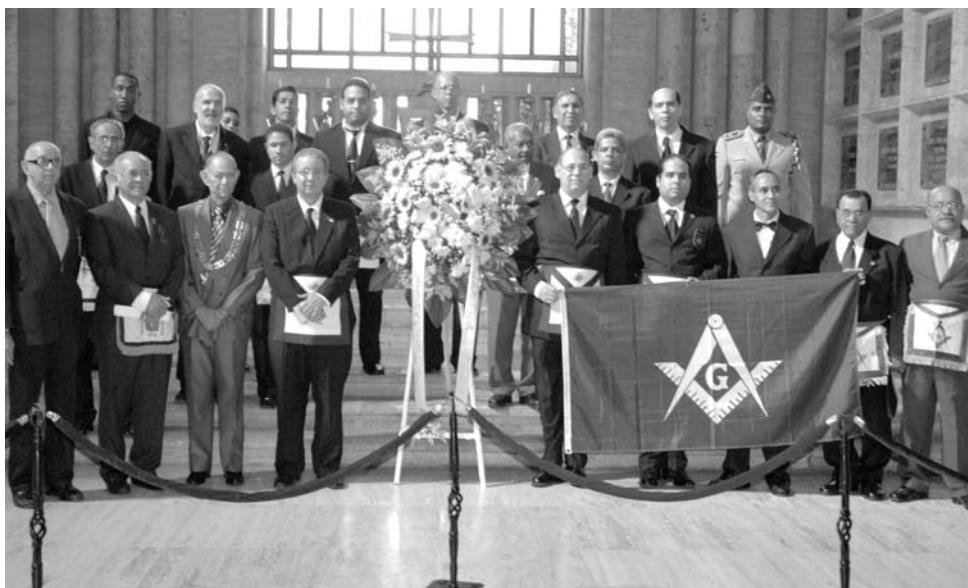
LODGE MEMBERS PRESENTED a wreath at the National Pantheon in Santo Domingo to honor more than a dozen Dominican heroes who were Freemasons.