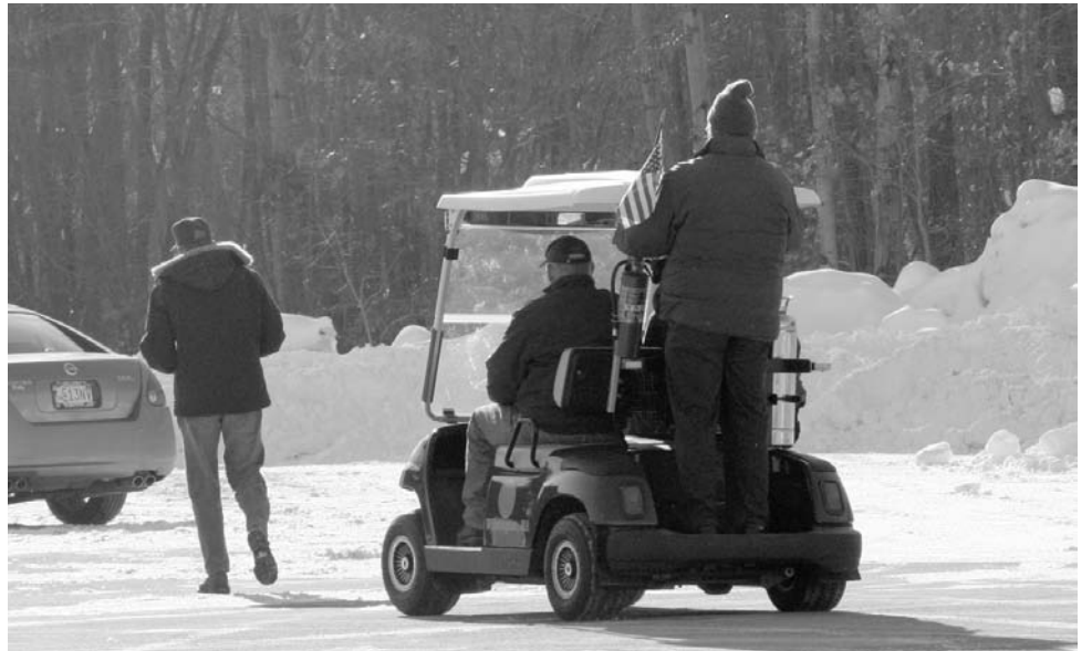
ON JANUARY 22, 2009, members of the Aleppo Fire Brigade got together to shovel out their trailer to get their "fire engines" ready for the January 24, 2009 Ceremonial.