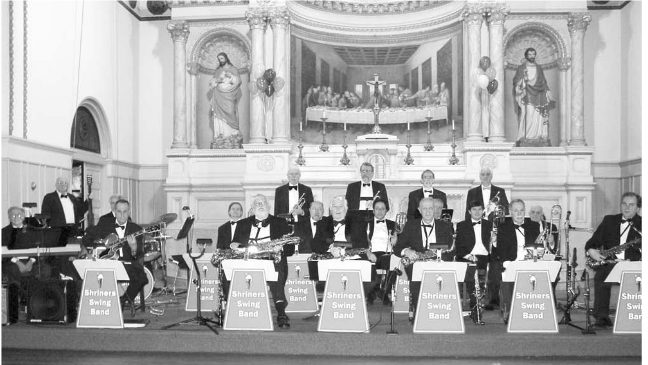
THE ALEPPO SHRINERS SWING BAND performed at St. Cecelia's Parish in Boston for an Evening of Swing on February 7, 2009.