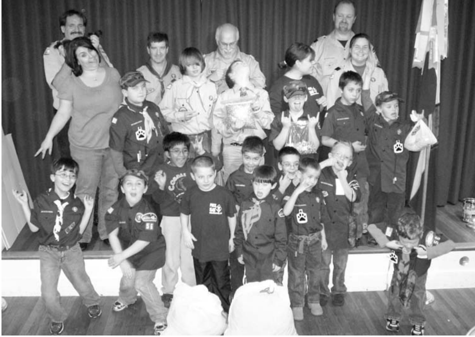
CUBSCOUT PACK 56 of Wilmington, MA, spent the past year saving up pull-tabs to donate for the Aleppo Shriners Children's Transportation Fund. They brought in over fifty pounds of tabs!