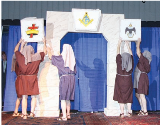
CASTING FOR THE ARCH PRODUCTION AT THE NOVEMBER 14, 2009 CEREMONIAL