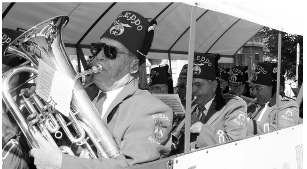
THE BRASS BAND participated in the East Boston Parade on October 12, 2008.