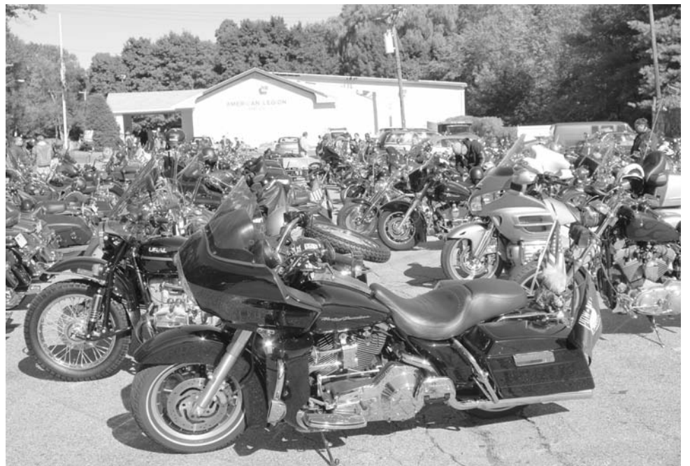
THE FIRST stop of the day was the Burlington VFW where the participants enjoyed coffee, donuts and breakfast sandwiches.