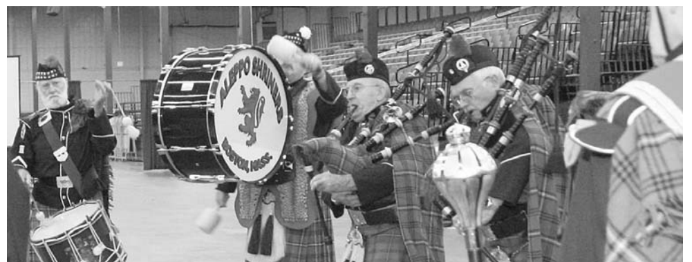
THE PIPE BAND played during the chicken dinner at the HONS Fair.