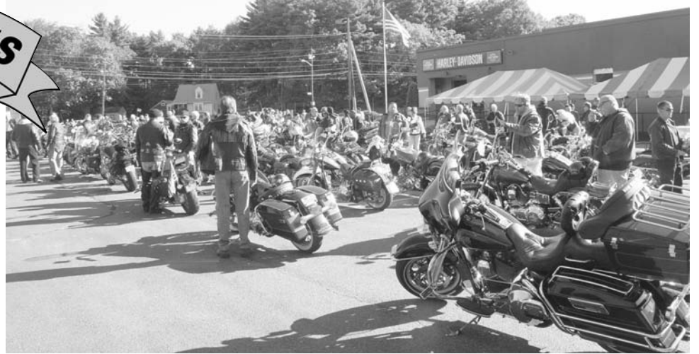
THE 2008 Aleppo Cycles Motorcycle Run began at Kelley's House of Harley Davidson in Billerica. Around 150 motorcycles came out on the beautiful morning to take part.