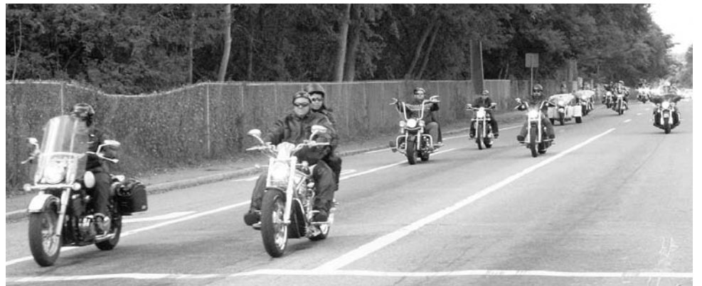
ROARING DOWN Pawtucket Boulevard in Lowell on their way to the Tewksbury/Wilmington Elks for the cookout.