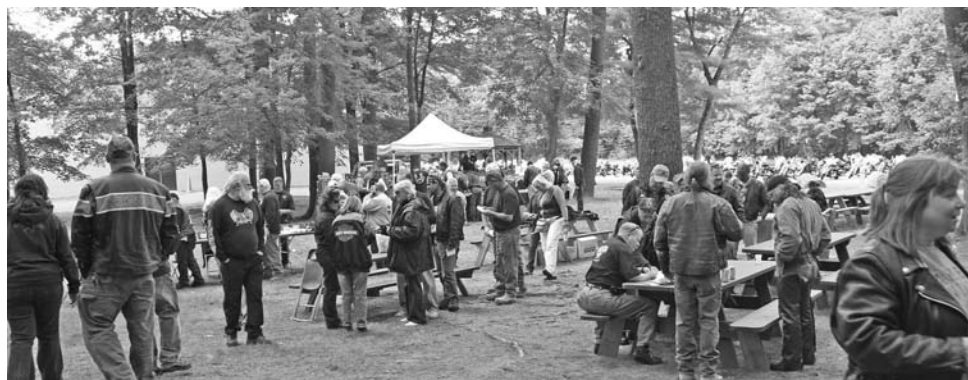
THE LAST stop of the run was the Tewksbury/Wilmington Elks for the cookout. There was live music, a raffle with prizes from local businesses, a tent selling motorcycle gear and tons of food!