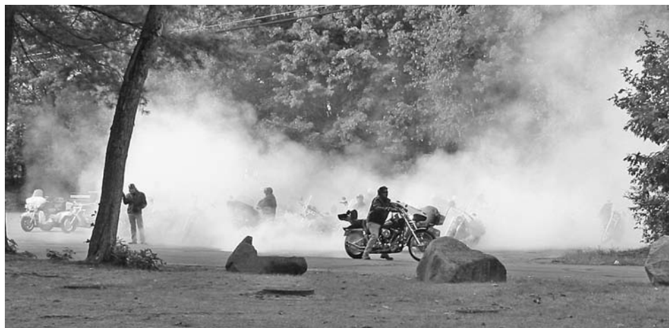
IT WOULDN'T be a motorcycle run without at least one burnout!