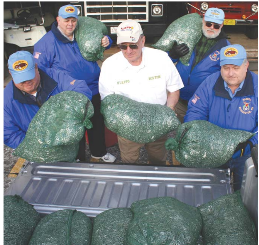
Local Shriners load over 900 pounds of pull-tabs to be recycled.

FACT: In one year, the Aleppo Shriners of Wilmington, MA, raised over $310,000 to provide transportation, housing and food for patients and their families.